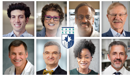
Canadian Leaders in Health Science /read more