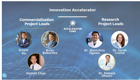
Funding Commercialization at UHN /read more