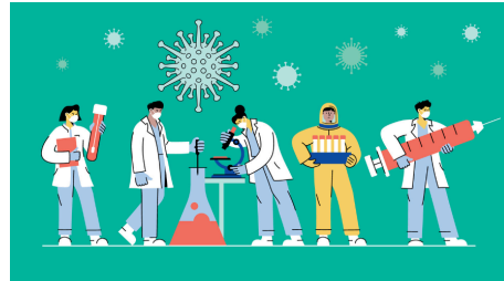
Advancing Health Through Innovation /read more