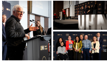
Inaugural Mission Excellence Awards /read more