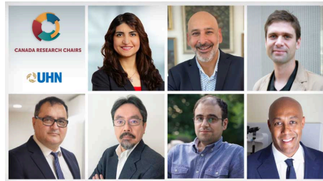
Canada's Research Leaders at UHN /read more