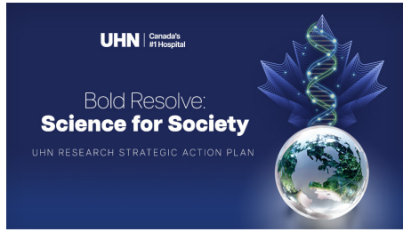
UHN's Bold Research Plan /read more