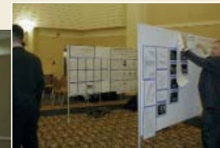
The Symposium was sponsored by the Ontario R&D Challenge Fund and private sector partners.